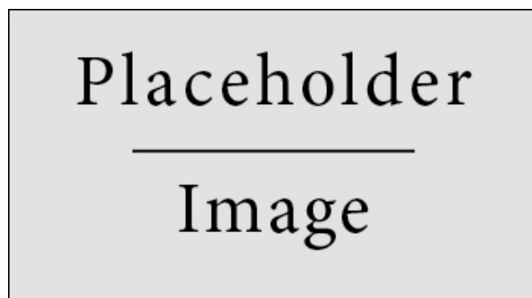
Figure 1: Figure caption.

The atomic weight of magnesium is concluded to be 24 g/mol, as determined by the stoichiometry of its chemical combination with oxygen. This result is in agreement with the accepted value.